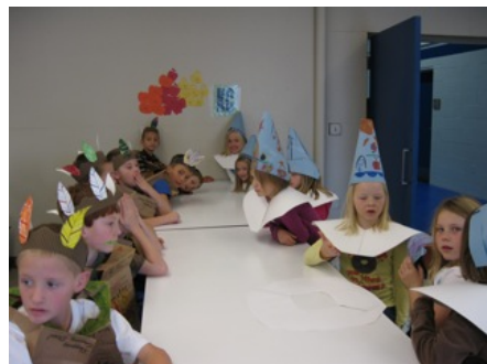
Second grade students share a Thanksgiving feast.